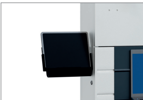
Mounted on the side of the media steles