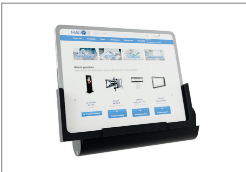
All-round support edges secure the tablet