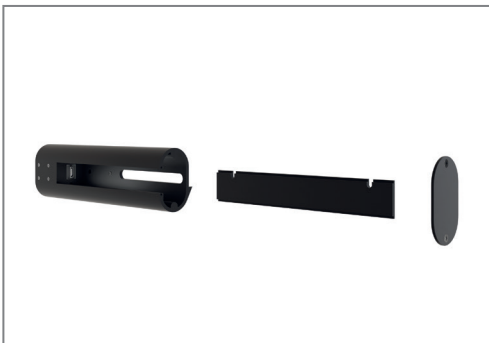
Internal USB 1 port